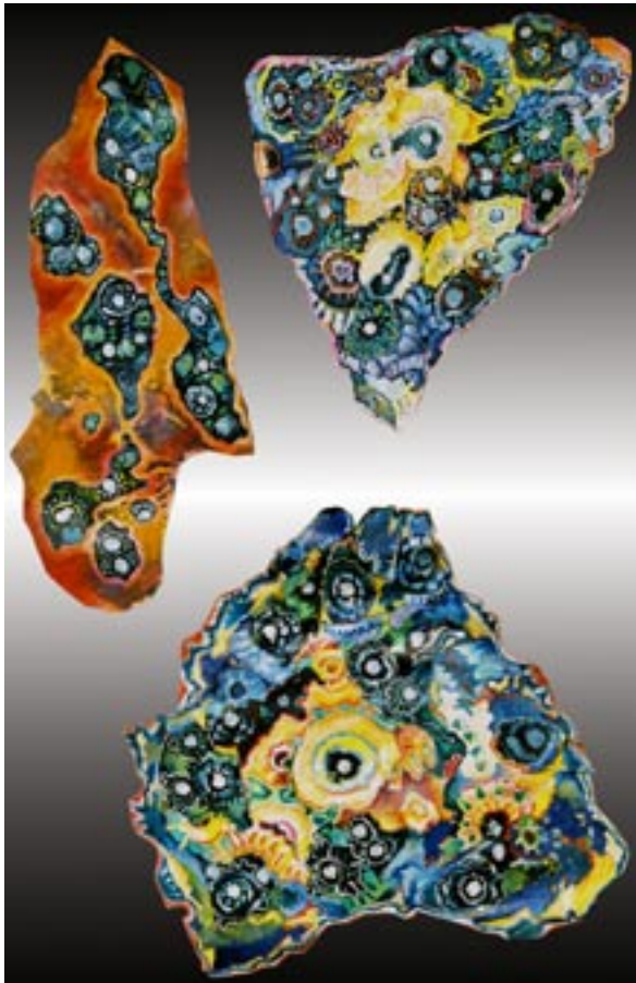
Fragments 1 - 3 size varies within 24"h x 24"w each oil/acrylic on canvas 2004 - 2005