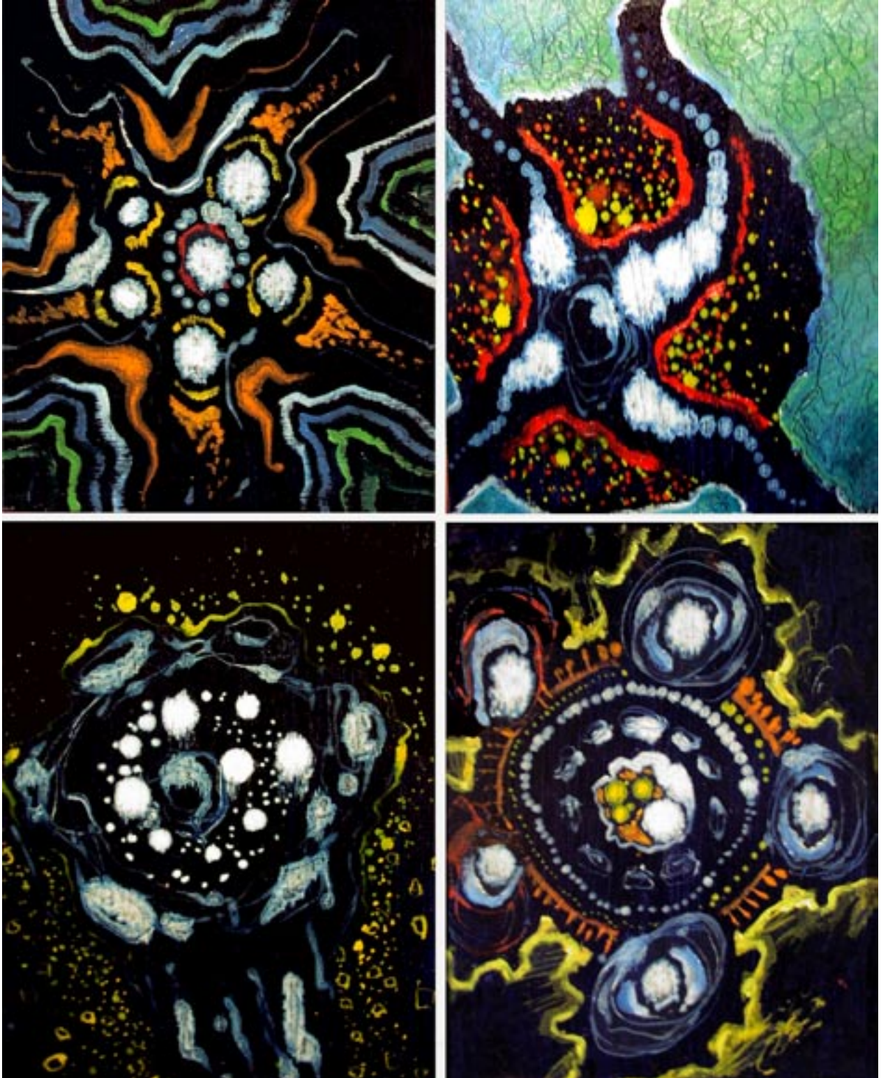
Microbes 1 - 4

Images copyright of the artist - all rights reserved.