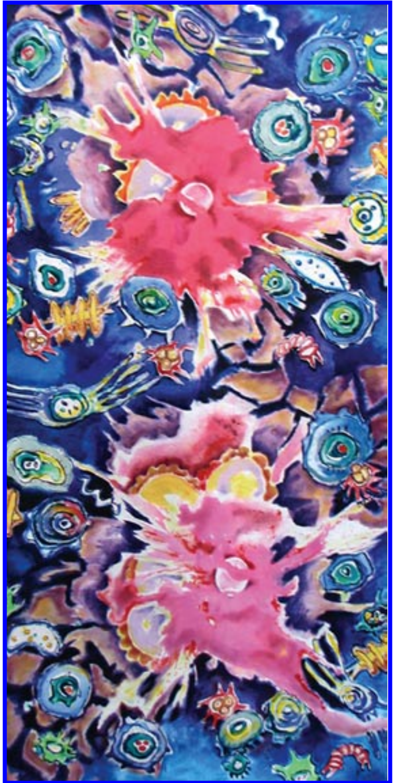
Double Nova 83"h x 43"w acrylic on canvas 2005