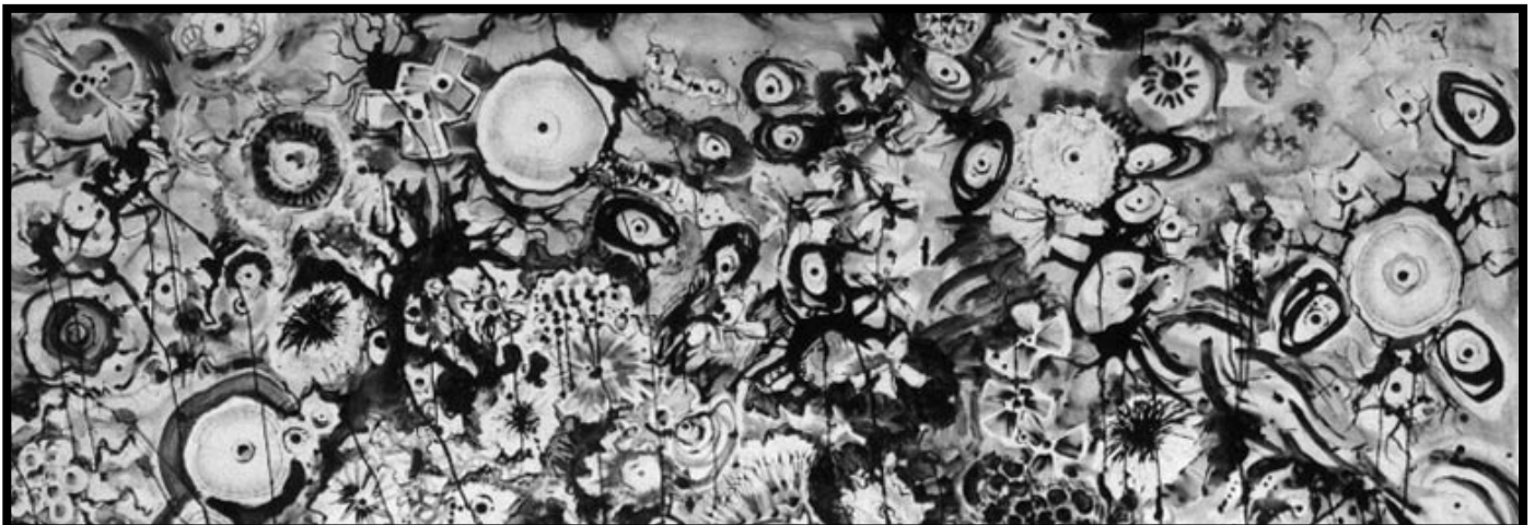
Room for the Spirit 53”x 105” india ink on vinylized canvas 2002

My paintings may be small – a single organism – or large enough to cover walls with a sea of cells in motion. The images refocus our awareness to the deeper nature of Nature – to remind us of our place in the world. It is a place where we engage wonder, connection to the whole, and the most profound mysteries of identity – such as, “What makes these cells a Self? And this Self a Soul?”