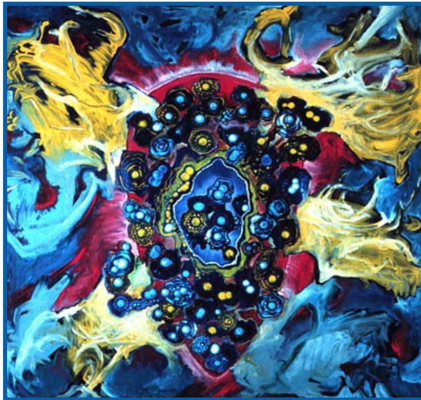
What makes these cells a Self? And this self a Soul?