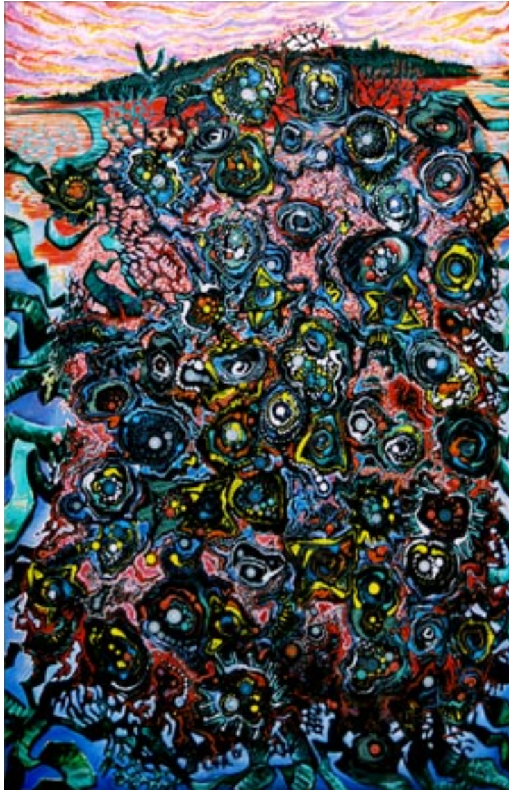
La Isla 48”h x 32”w oil on panel 2006