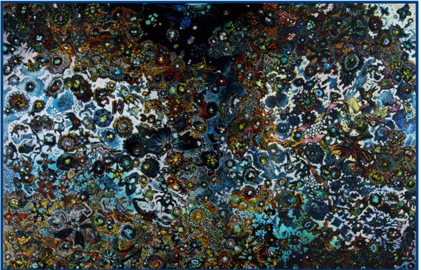
Geo Grande 96”h x 144”w oil on panels 2005