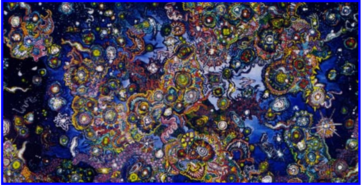
Sea of Consciousness 48”h x 96”w oil on panel 2001