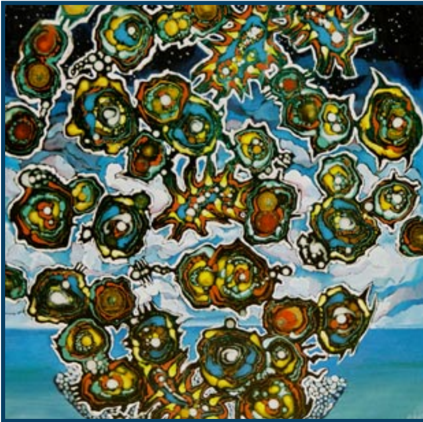
Birth of Venus